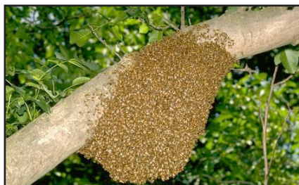
Figure 2. Bee swarm cluster on tree branch.