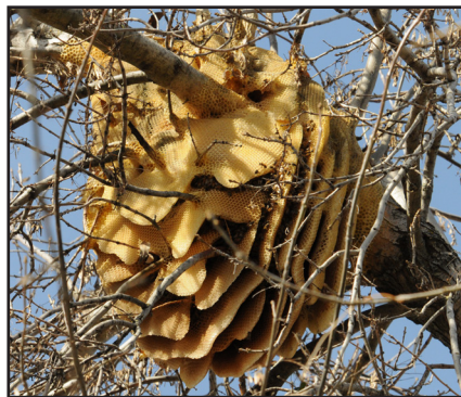
Figure 3. Feral beehive with combs.

spot where the cluster formed, such as a tree limb, the overhang of a house, or another unusual place. These "exposed comb" colonies (Figure 3) may exist until fall (or year-round in warm-winter areas), but robbing bees, hungry birds, and inclement weather usually put an end to these colonies and their combs.